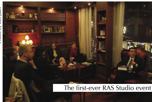
The first-ever RAS Studio event