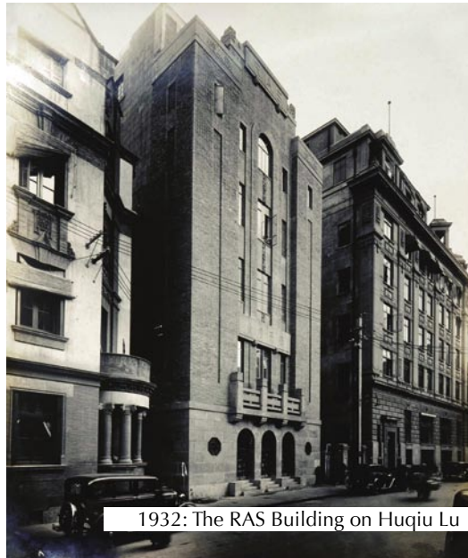
1932: The RAS Building on Huqiu Lu